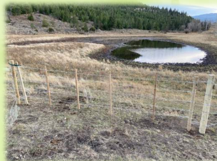
Top: Restored wetlands at the Yaqan Nukiy Phase 3 site, Middle: Fencing installation at Stud Pasture, Kamloops Bottom: Wildlife friendly fencing at New Gold, Kamloops

Although in-person workshops and gatherings were put on hold for 2020, the Wetlands Education Program continued to safely work on wetland restoration projects throughout the year. Across 4 sites, BCWF was able to restore almost 110 hectares of wetland and floodplain habitat across BC for the benefit of wildlife and humans alike. Three restoration initiatives are described below.