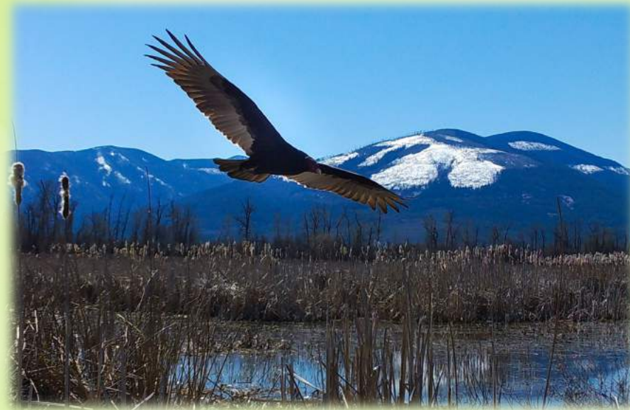
Turkey vulture captured on a wildlife camera at the Yaqan Nukiy Wetlands near Creston, BC.