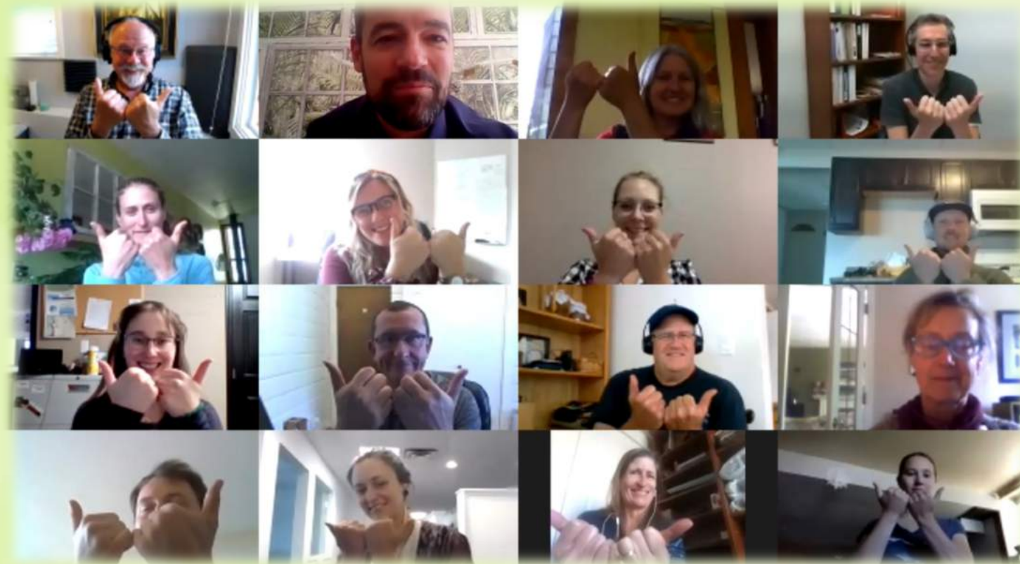
Participants from the Cumberland Map our Marshes workshop showing off their “W”etlands sign

Map our Marshes is a 1-2 day crash course that teaches the value and tools of community mapping and inventory of wetlands. This information will help communities identify conservation needs at a wetland or watershed scale and share their data publicly with other interested parties. Unless wetlands are identified and mapped, they could go unrecognized and be inadvertently destroyed by agriculture, development, ranching, or invasive species.