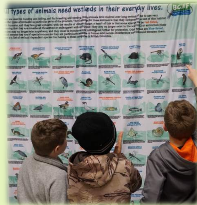
Students learning about the value of wetlands during a visit from the Wetlands on Wheels

Experiential outdoor games to learn and understand the important ecological value of wetlands were also offered through this initiative. Over 1050 kids from 48 classrooms were visited before the Wetlands on Wheels initiative was shelved due to COVID-19 restrictions.