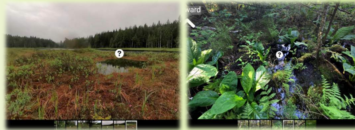
Screen captures from the virtual wetlands scavenger hunt. Left is part of the bog tour, right is from the swamp tour

Over 2 days, Wetlandkeepers workshops educate participants about wetland conservation and provides them with technical skills to steward the wetlands in their own backyards. Each course is uniquely tailored to the host community, and topics such as wetland classification, mapping, soil sampling, and vegetation identification are part of the base structure of this course.