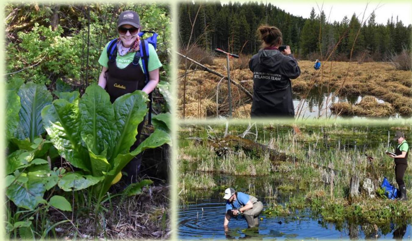
Staff from the Wetlands Education Program collecting footage to use for virtual workshop modules

Due to COVID-19 and the risks associated with hosting in-person workshops, especially travelling to various communities all over the province, the Wetlands Team made the decision to reformat all WEP-led workshops to a virtual setting. This meant the Wetlands Education Program spent the spring and early summer hard at work revamping our typical hands-on, in-person workshops into interactive and engaging virtual workshops!